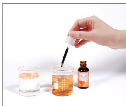
Image of solving in water. As shown in the picture left, It is the propolis of our company produced non-alcohol, water-soluble WEEP method. It is totally soluble in water.

(○ : Big amount extraction, △ : Small amount extraction, × : Very small amount extraction)