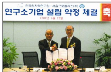
Make an agreement with Korea Atomic Energy Research Institute.