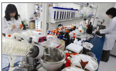
Attached laboratory of Seoul Propolis Co., Ltd